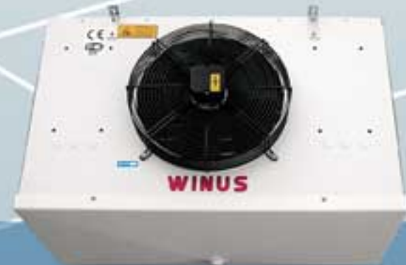
Brine unit coolers

Dimensioning and supply of all plant components