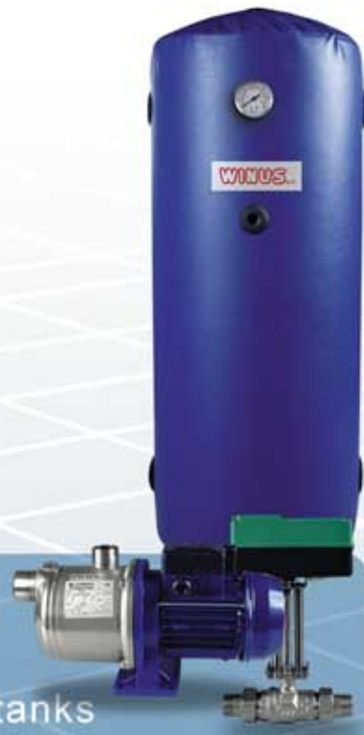
Pumps Valves Storage tanks