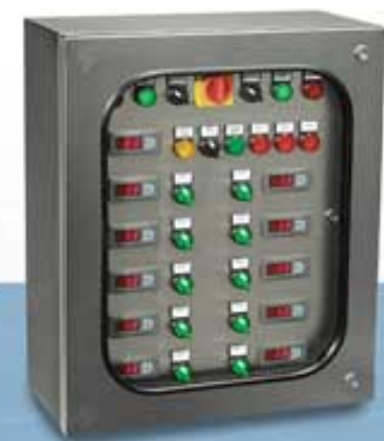
Customized control panels. Thermometers and thermostats